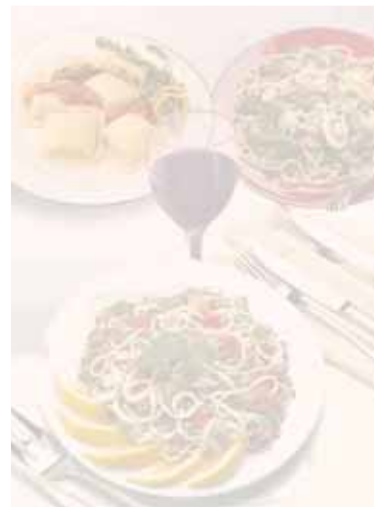
PT primi tradizionali