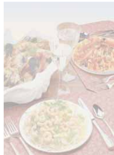
PM primi di mare