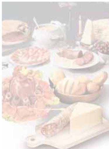
AT antipasti tradizionali