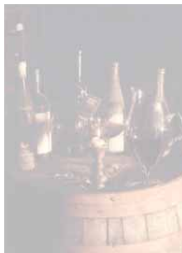
V2 la cantina