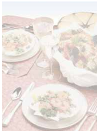
AM antipasti di mare