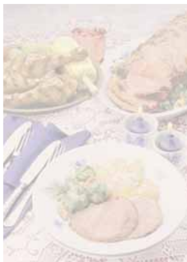
ST secondi tradizionali