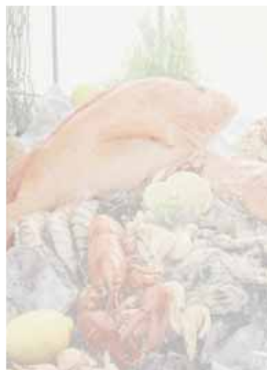
SM secondi di mare