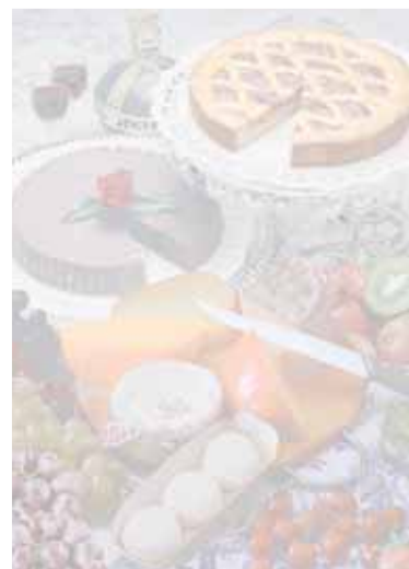
DF dolci e frutta